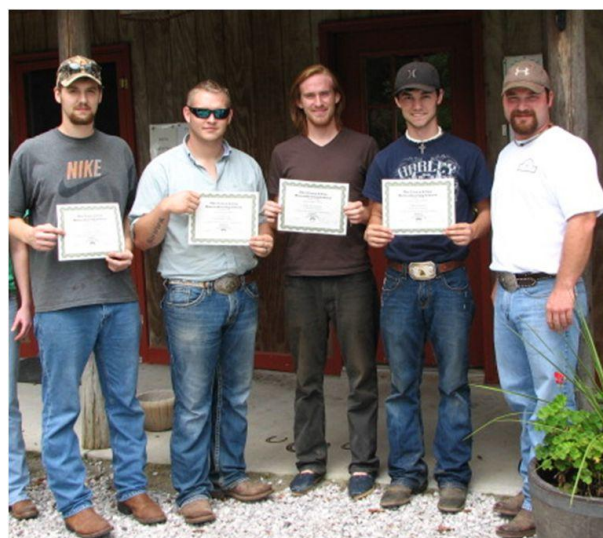
RECENT GRADUATES AND BWFA CERTIFIED FARRIERS